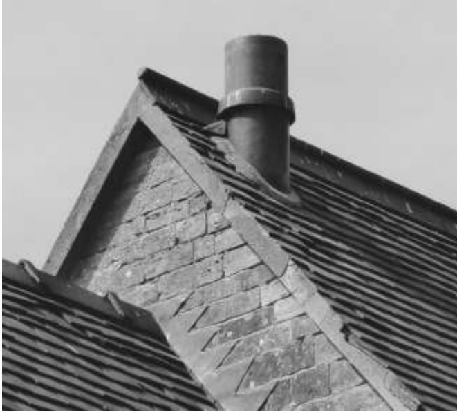
Old Flue to be capped and again the verge on the east wall Chancel roof.