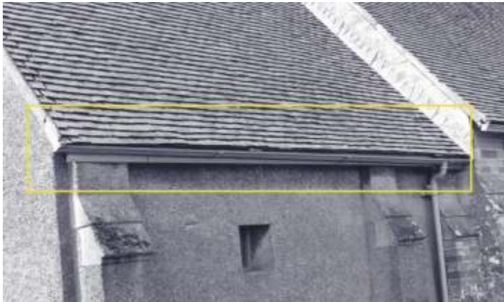
The north wall / roof.

The above shows the Verge on the end of the west wall / south roof and the tile movement around the gutters.