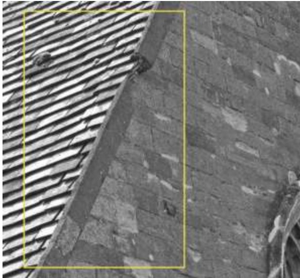
The west wall / north roof verge already broken off. We are awaiting a quotation from the stone masons who repaired the west wall and the west wall window.