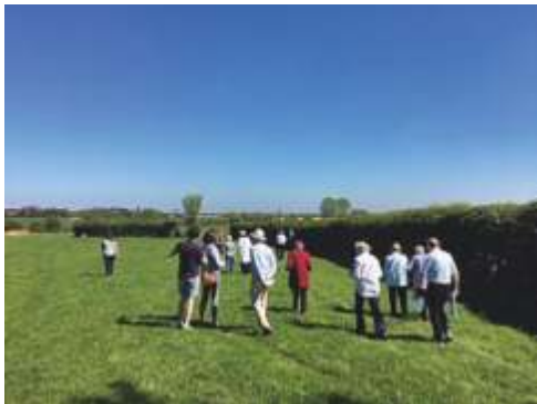
Blessing of the Sheep